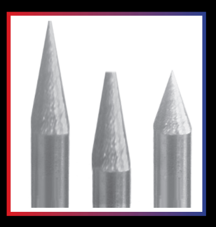
Consistent Results: Stepless grinding angles (20-60 degrees)